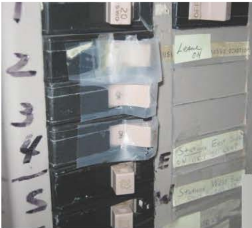
Image above shows breakers taped in the ON position. This practice should never be done.