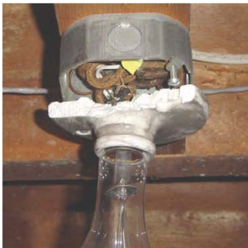
This image shows a broken light fixture. This exposes the wiring to physical damage, dust, dirt and moisture accumulation.

Light fixtures should be permanently mounted to the base and show no signs of damage. Light fixtures that are hanging unsupported by wiring, puts undue stress on the electrical connections. These two conditions present the potential for an electrical short, which can produce sparks that can ignite combustibles.