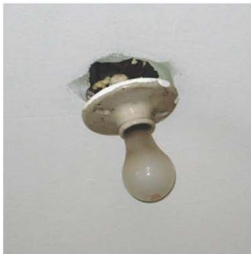
This image shows a light fixture that is unsupported, which puts undue stress on the electrical connections.