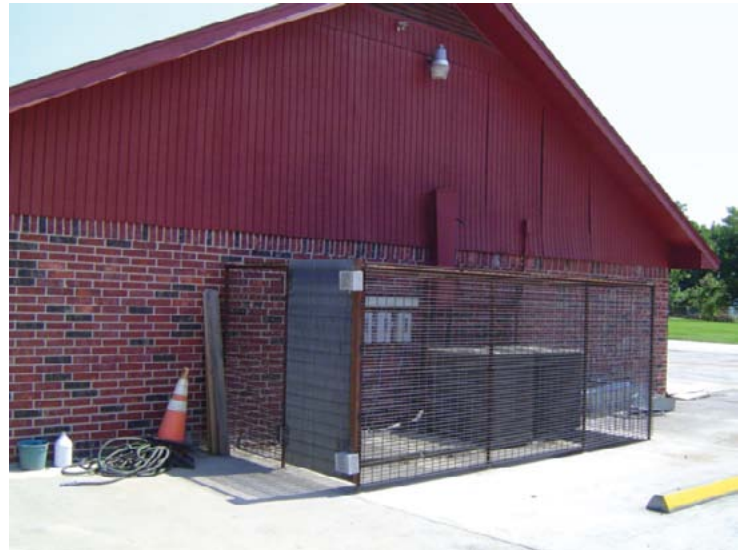
Example: This photograph illustrates AC units protected by a steel cage and security lighting.