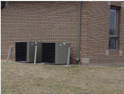
Example: This photograph illustrates AC units located at the back of the building creating an easy target for theft.